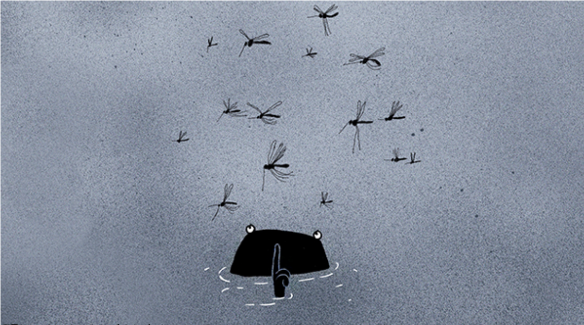
Two children are talking about the frog and the dragonflies. They are talking about the frog and the dragonflies when they are two