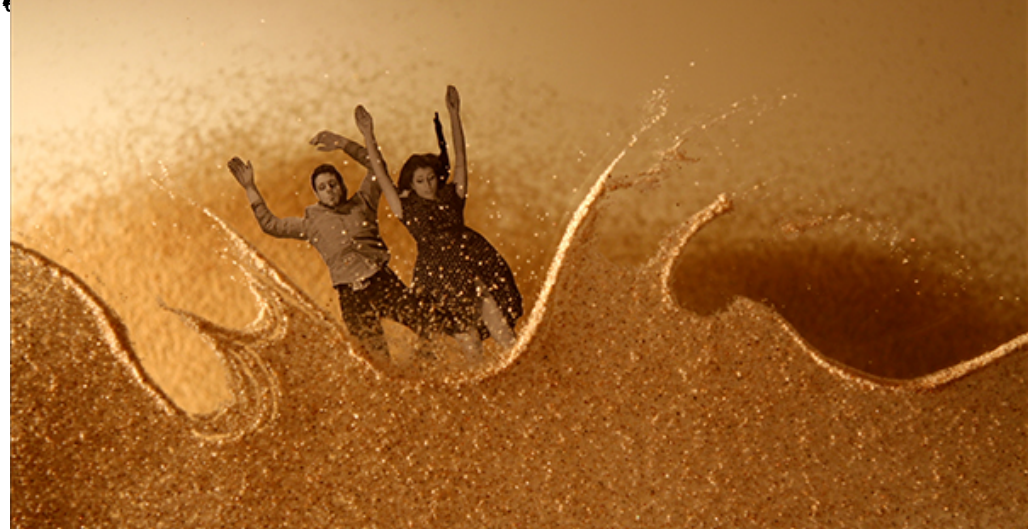
...as body in connected to ... festival, ...