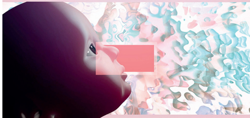
[Name], [Institution] (2015), [Title], [Medium], [Duration].