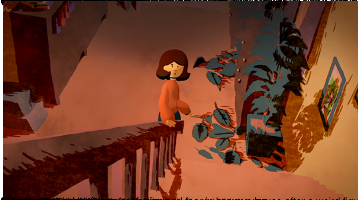
The girl is looking at the plant in the house after a weird figure starts