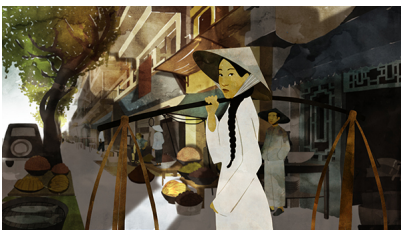
2D computer animation, Rotoscope