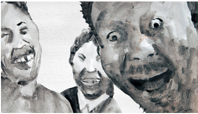
Drawing on paper