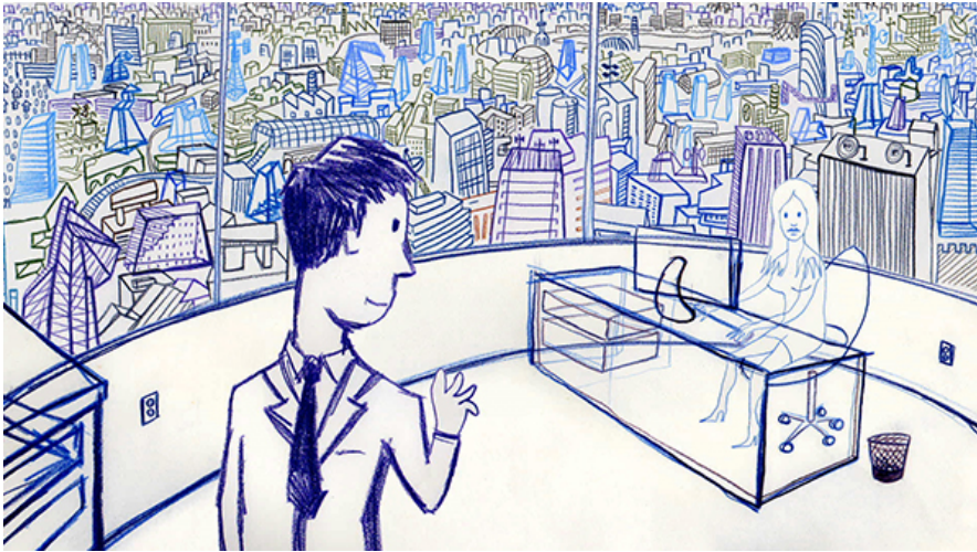
Drawing on paper

Transparency, Daniel Šuljić (CROATIA, 2015), 6' 10"